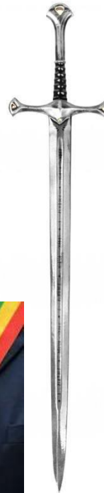
Consul Personal Banner Officials